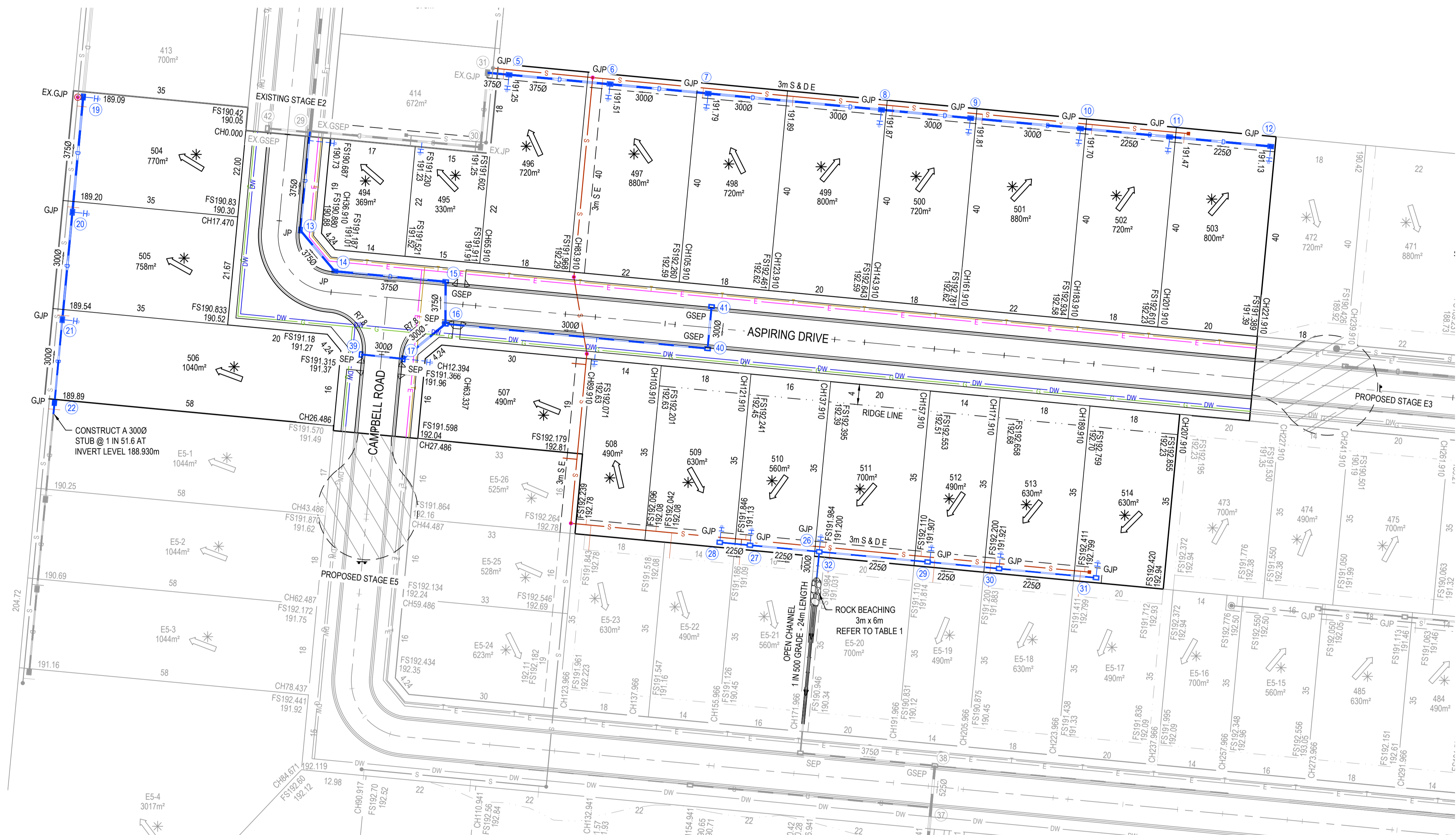
TABLE 1 - ROCK BEACHING SIZING