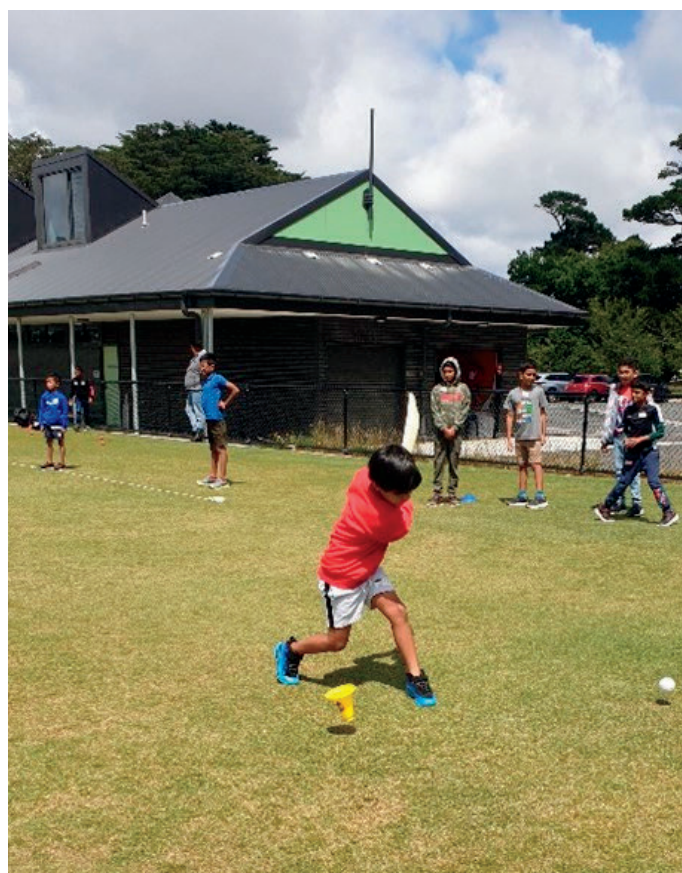
CRICKET BLAST SCHOOL HOLIDAY ACTIVITIES WITH THE LUCAS CRICKET CLUB