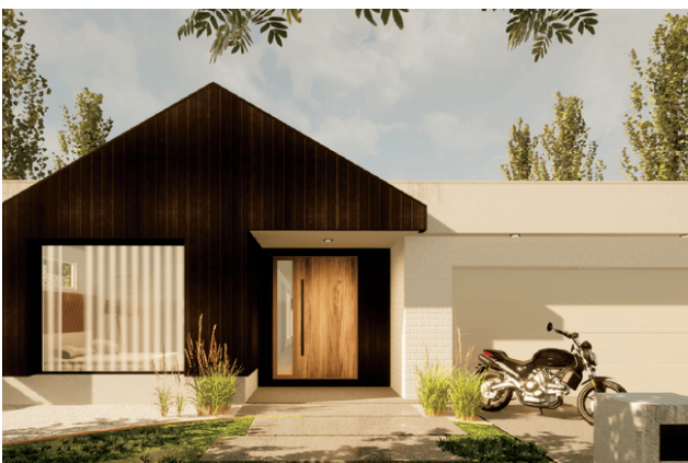
Modern Minimalist: JV Dodd Building

Rooted in Scandinavian simplicity and blonde timber tones, the Scandi-barn architectural style blends the classic barn shape with modern design principles. Internally, rustic-meets-Scandi aesthetics thrive, featuring pale timbers, a minimalist color palette, and an abundance of natural light.