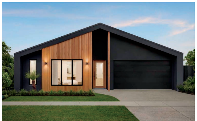
Scandi Barn: Hudson Ridge Builders Byron Façade Lucas Display Village