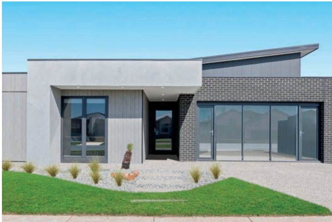
Mixed Materials: Highmark Homes Lucas Display Village Facade: Burrumbeet

The trend of mixing materials in modern homes allows for creative exploration, combining weatherboards, stone, bricks, and steel. These homes, with their austere ornamentation, focus on showcasing organic materials, providing homeowners the opportunity to customise their home without deviating too far from contemporary norms.