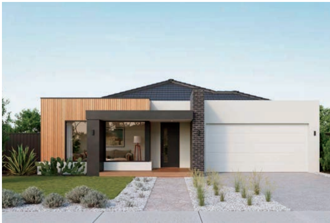
Mixed Materials: Sherridon Homes - Camden Facade Lucas Display Village