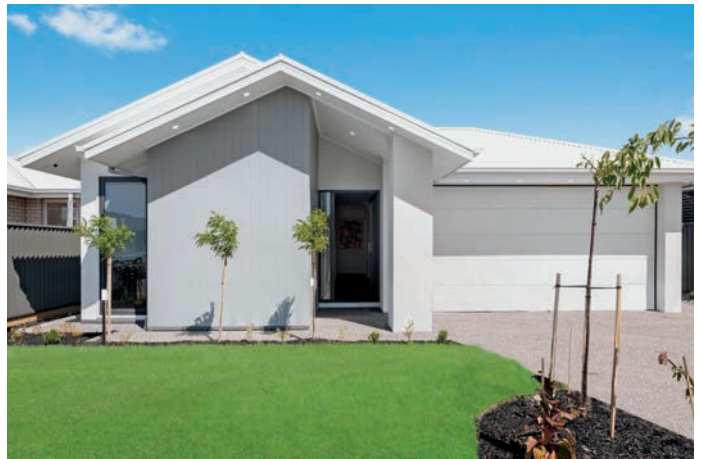
Coastal: Highmark Homes Lucas Display Village Facade: Lonsdale

Inspired by seaside locations, coastal design emphasizes natural tones and textures, incorporating materials like timber and stone. These homes prioritise a connection between indoor and outdoor spaces, employing generous windows and a monochromatic palette to capture the light, breezy aesthetic of the coast while staying true to modernist principles.