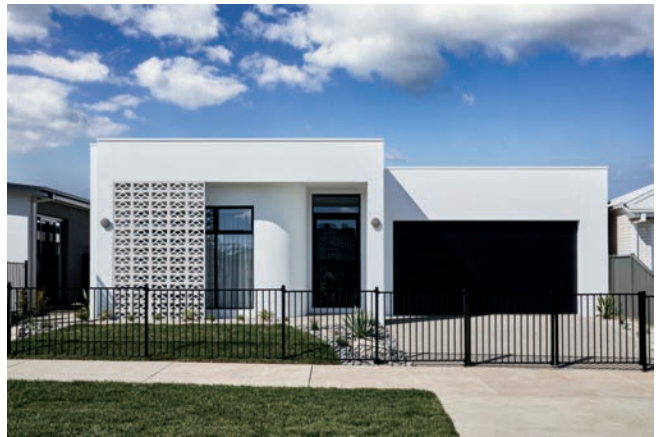
Modern Minimalist: GJ Gardner Banksia 278 Design - Lucas Display Village

Modern minimalist homes embody a stripped-down design that eliminates unnecessary embellishments, emphasising clean lines and functionality. From monochromatic facades to uninterrupted flows, these homes create a canvas for residents to express their personalities without the burden of clutter.