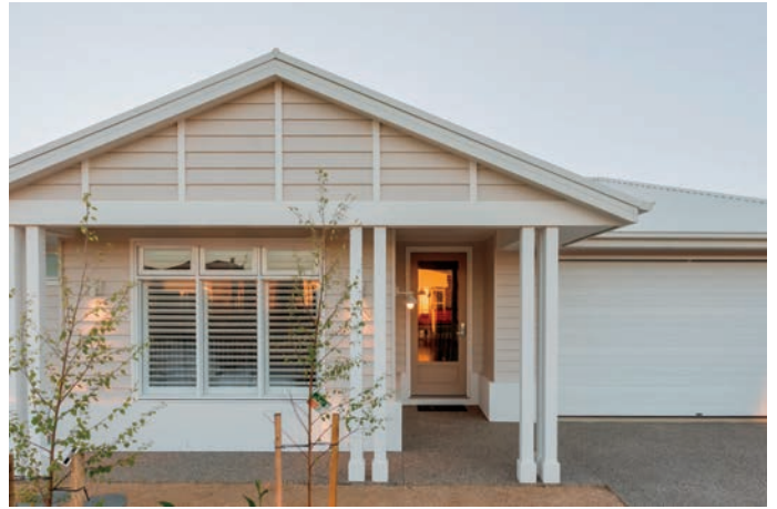
Hamptons Charm: McMaster Aura Lucas Display Village

The enduring popularity of Hamptons style in Australian homes reflects its timeless, elegant design. Characterised by gables, verandas, and timber trims, Hamptons façades exude sophistication while maintaining a relaxed and laid-back lifestyle, making them a perennial favorite among homeowners.